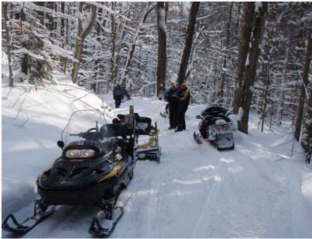
Meeting a groomer on the trail.