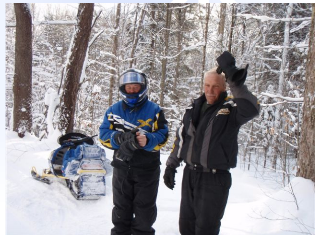
Brian's co-worker out grooming!