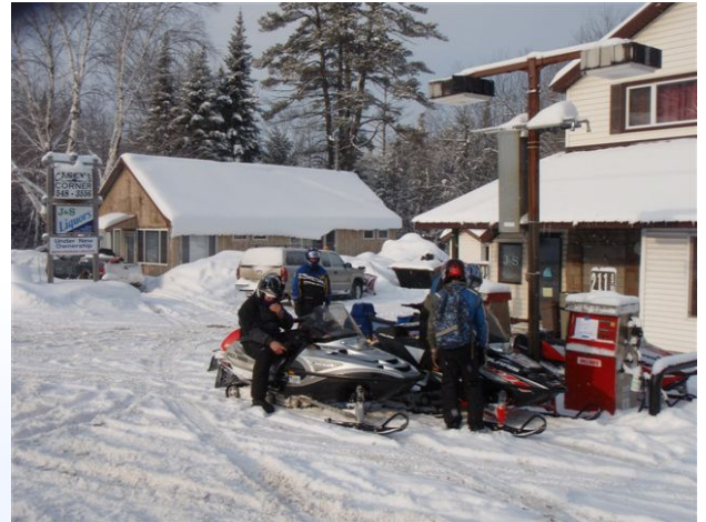
The Morning fuel up at Casey's Corner.

D to the junction of C7G. There we proceeded north on C7G (again with limited signage) into Mecó and stopped for fuel and a quick bite at Stewarts on Rt 29A around 4 pm.