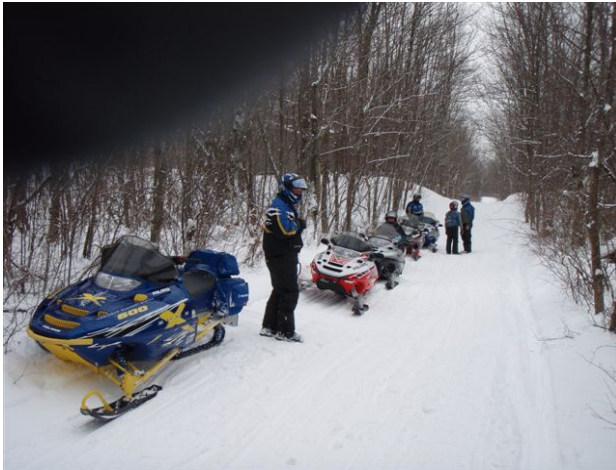
Taking a break on the Stanley Turnpike.

Gibby's Diner Established 1952 Quaker Street, New York Hours: 7:30am-7:30pm Closed Mondays & Tuesdays 518-895-2063