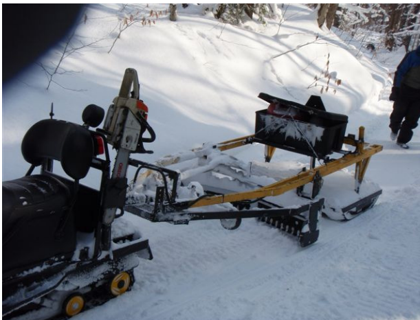
Checking out the drag

Monday morning we fueled up five sleds at Casey's Corner in Oxbow and headed south on C8 where we stopped to play in the powder on Spy Lake then onto the Powley Rd. where we picked up C8A. Yielding to the local groomer, Brian recognized the operator as a co-worker, so we stopped to swap grooming stories and took a close look at the drag. Then continued on past Pleasant Lake and Rockwood where we picked up C8E down to C7D into the Mohawk Valley.