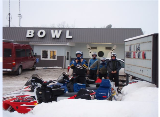
Canajoharie Bowling Alley