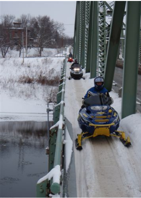
Fort Plain Brige - Lock 15