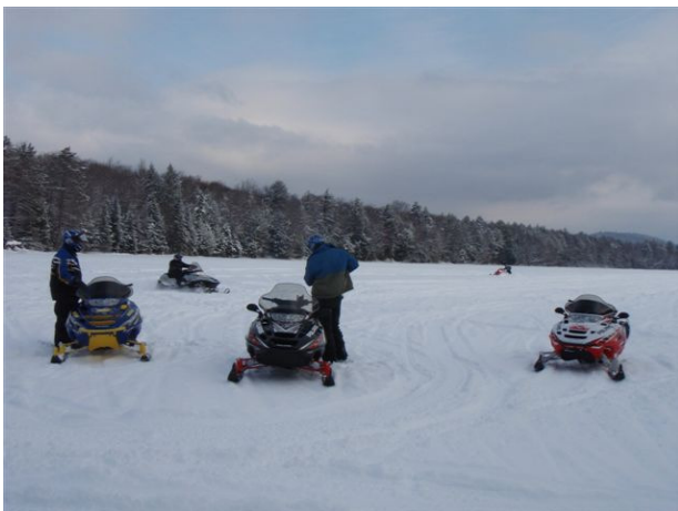
Riding out on Spy Lake.